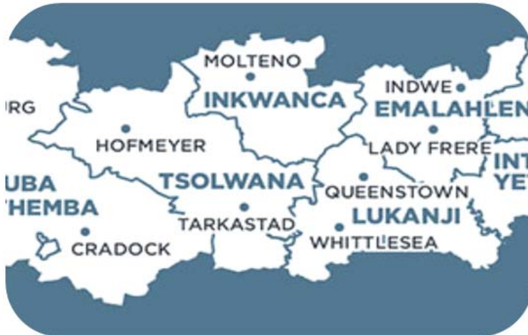
Fig. 2. Map of Chris Hani Local Municipality

data. Focus group discussion were also used to ensure proper investigation.